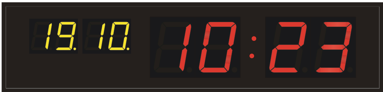
Figure 1: DT100-8C1-E front view, black frame

The temperature is obtained from external Ethernet thermometer TME (product of PAPOUCH s.r.o., extra accessories). Multiple clocks can be connected to one TME.